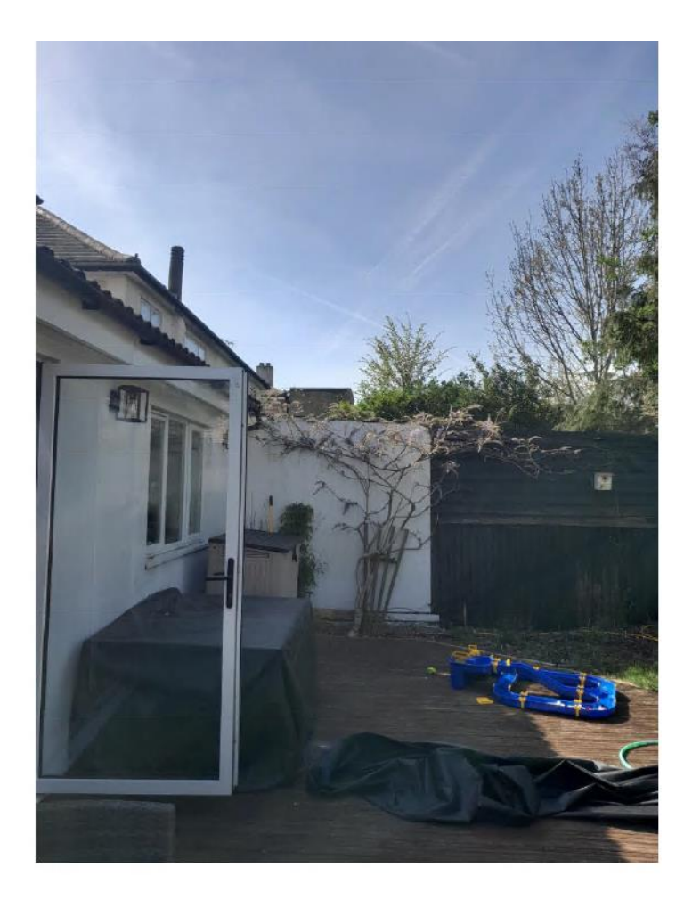
Boundary view of No. 33 from host property