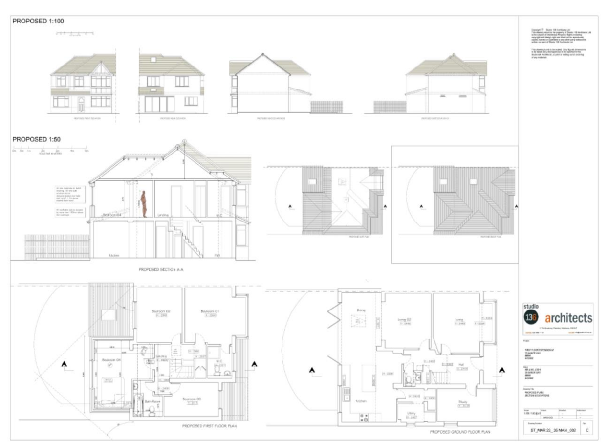
Superseded proposed plans and elevations